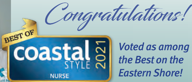
Nettie Widgeon, RN

The readers of Coastal Style magazine have selected three AGH medical providers and one of our nursing professionals – Nettie Widgeon, RN – as among the Best on the Eastern Shore!